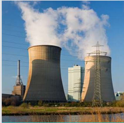
Power and energy