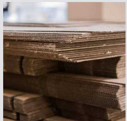
Pulp and paper