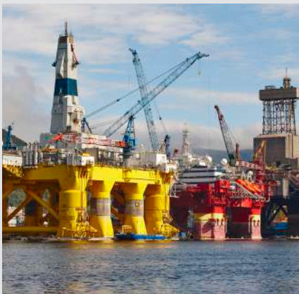
Oil and gas