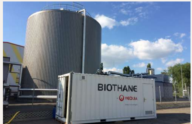
Pilot testing in Poland

“ As part of the Veolia family we provide the most appropriate industrial effluent and Biogas treatment solutions: tailored and optimized to the needs of our clients ”